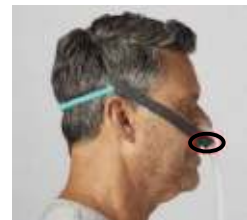
Figure 5: Therapy Mask 3100 NC/SP