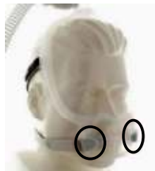
Figure 3: DreamWear Full Face Mask