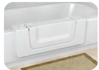
Use as Full Tub