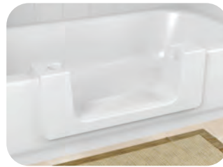
Use as Step-In Shower

Our Fastest Growing & Most Versatile Product!